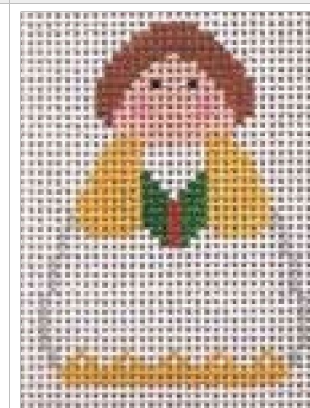
Choir Angel 165-78 - 2½" x 2¾" #13 mesh