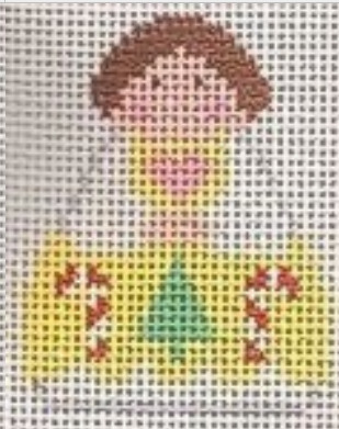
Yellow 165-73 - 2½" x 2¾" #13 mesh