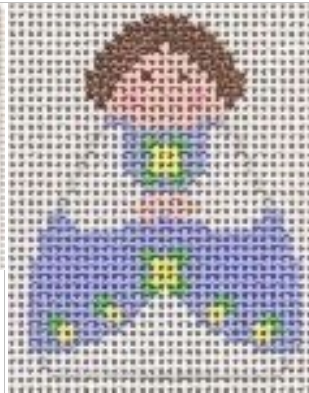
Blue/Yellow Flowers 165-69 - 2½" x 2¾" #13 mesh