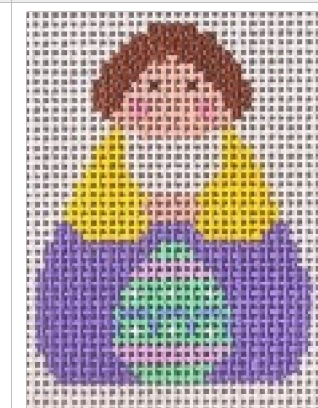
Easter 165-75 - 2½" x 2¾" #13 mesh