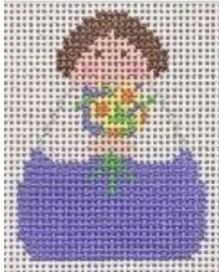
Sunflower Angel 165-72 - 2½" x 2¾" #13 mesh