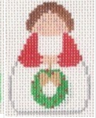
Red Sleeves and White Dress w/ Wreath 165-28 - 2½" x 2¾" #13 mesh