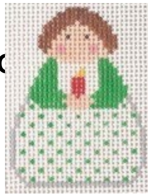
Red w/ Candle 165-22 - 2½" x 2¾" #13 mesh