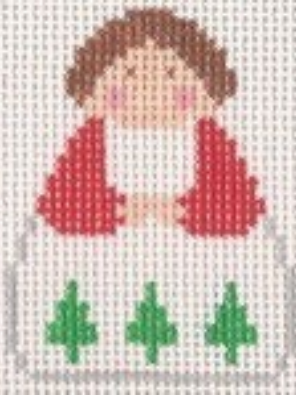
Trees at Bottom 165-30 - 2½" x 2¾" #13 mesh