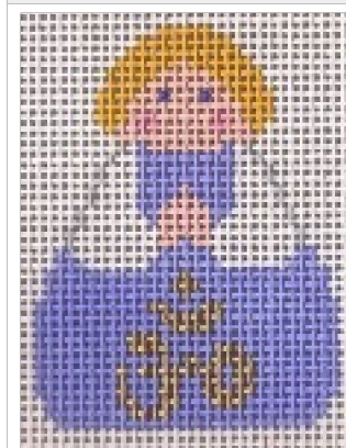
Ohm Sign 165-76 - 2½" x 2¾" #13 mesh