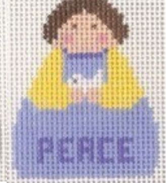
Peace w/ Dove 165-24 - 2½" x 2¾" #13 mesh