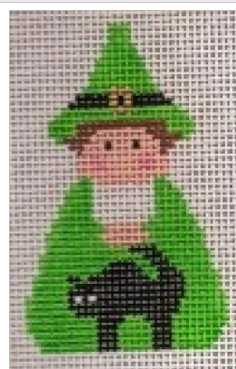
Witch with Cat 165-74 - 2½" x 2¾" #13 mesh