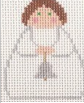
Silver Bell 165-23 - 2½" x 2¾" #13 mesh