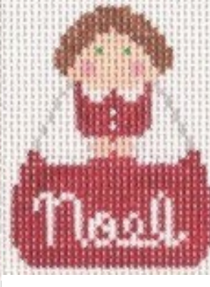
Noel 165-31 - 2½" x 2¾" #13 mesh