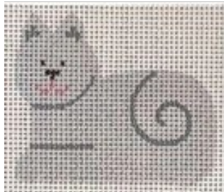
Cat 165-68 - 2¼" x 2½" #13 mesh