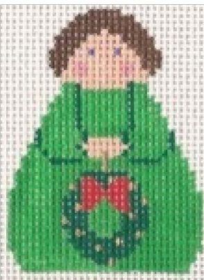
Green w/ Wreath 165-29 - 2½" x 2¾" #13 mesh