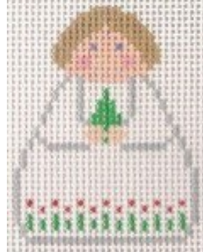
Tree w/ Green and Red Flowers 165-26 - 2½" x 2¾" #13 mesh