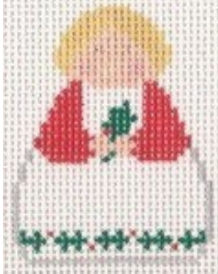
Holly 165-25 - 2½" x 2¾" #13 mesh