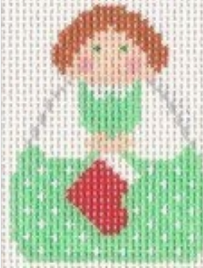
Red Stocking 165-27 - 2½" x 2¾" #13 mesh