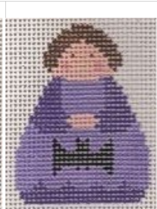
Bat 165-71 - 2½" x 2¾" #13 mesh