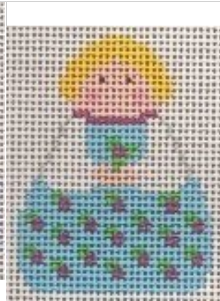
Rosebud 165-70 - 2½" x 2¾" #13 mesh