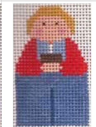
Birthday Boy 165-77 - 2½" x 2¾" #13 mesh