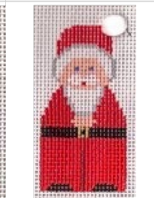
Santa 165-79 - 2½" x 2¾" #13 mesh